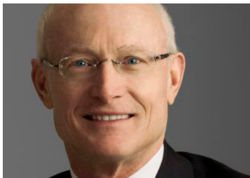
Michael E. Porter ICHOM Cofounder and The Bishop William Lawrence University Professor, Harvard University