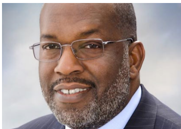
Bernard J. Tyson Chairman and CEO of Kaiser Permanente